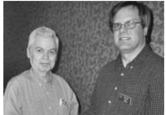
Claude Vogel Art Glatt Award