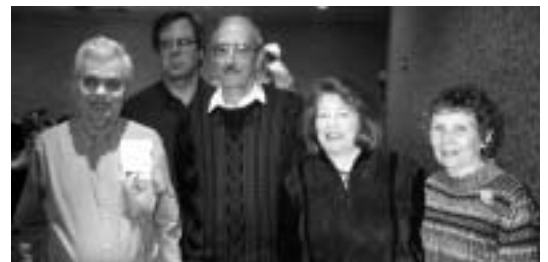
Ace of Club Winners.