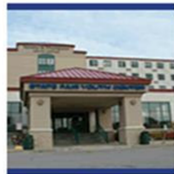
Tommy G. Thompson Youth Center